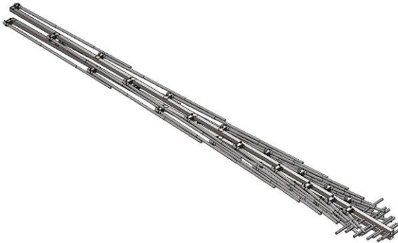
Figure 2: Antenna in stowed configuration